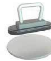
Sealed as standard remove with suction cup